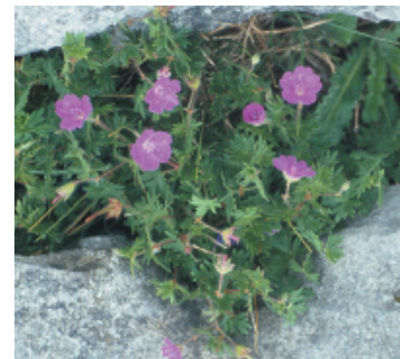
Bloody Cranesbill, most colourful of grike colonisers