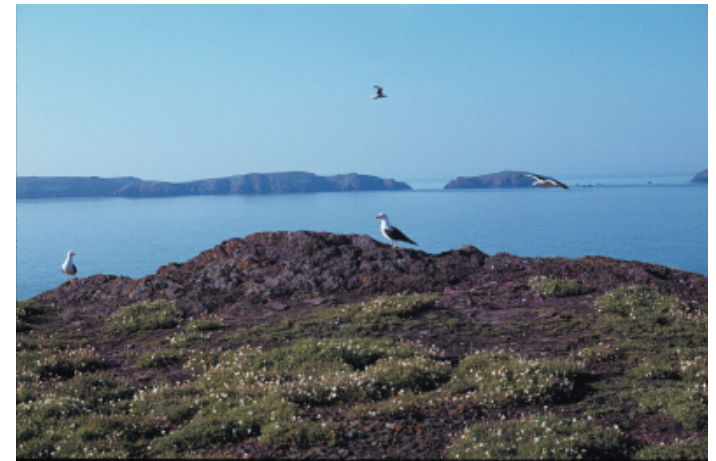
Skokholm Neck, view to Skomer and Middleholm