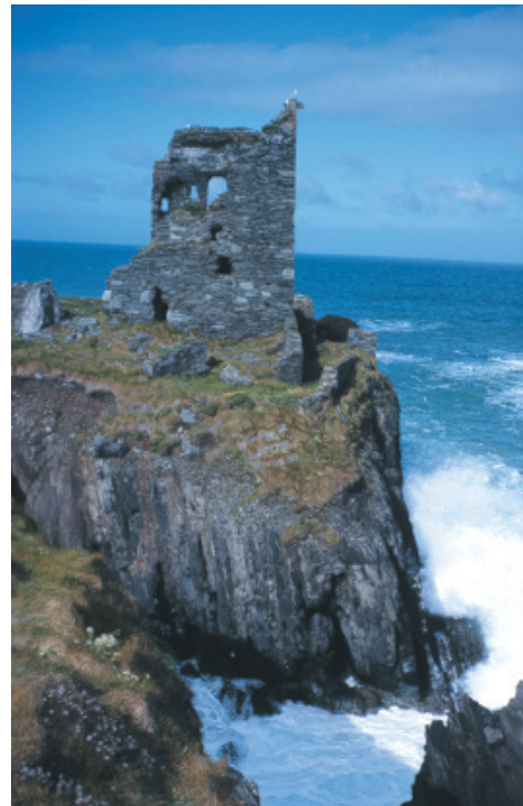
O'Driscoll's Castle, used by gulls and Hooded Crows